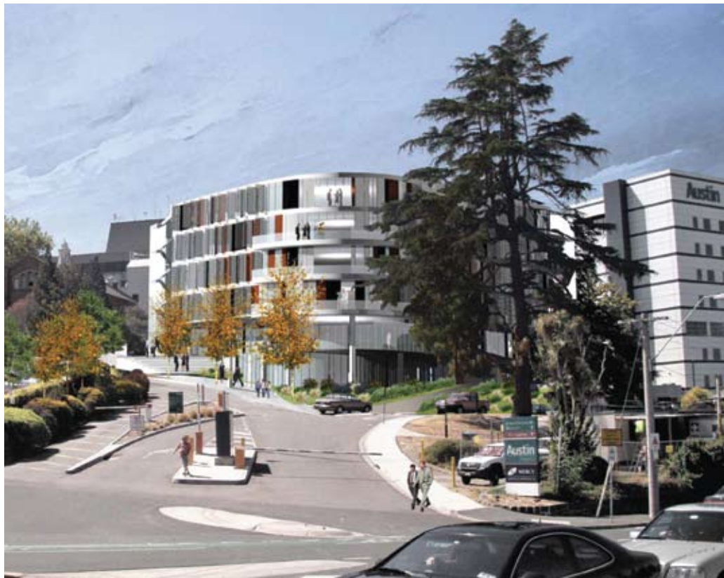
* Final facility concept visuals

Once completed, the Olivia Newton-John Cancer and Wellness Centre will provide patients with a purpose-built facility designed specifically to provide the best in care, treatment, support and hope for patients with cancer.