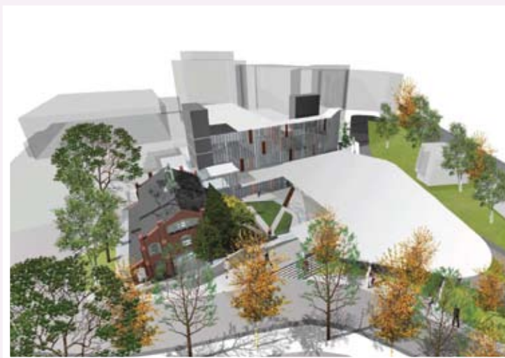
* Concept visuals of Stage 1

A ustin Health's driving force has always been to provide patients with the very best of care – always and without exception.